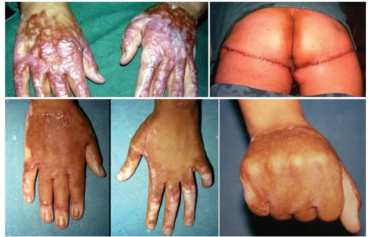
Fig. 1: Case No. 26; 28 years old girl with post burn hypertrophic scaring in both hands. Donor sites were bilateral subgluteal creases of 18x11 cm and 20x12 cm. Graft taken well with full function regain in aesthetically accepted hands.

wound closure exactly at the subgluteal skin crease. We usually cover the subgluteal wound dressing with an isolating polyurethane adhesive transparent film, to isolate it from perineal area as much as possible till complete healing.